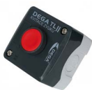
DEGA TL II stop button