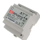
External power supply DR 60W, DR 100W